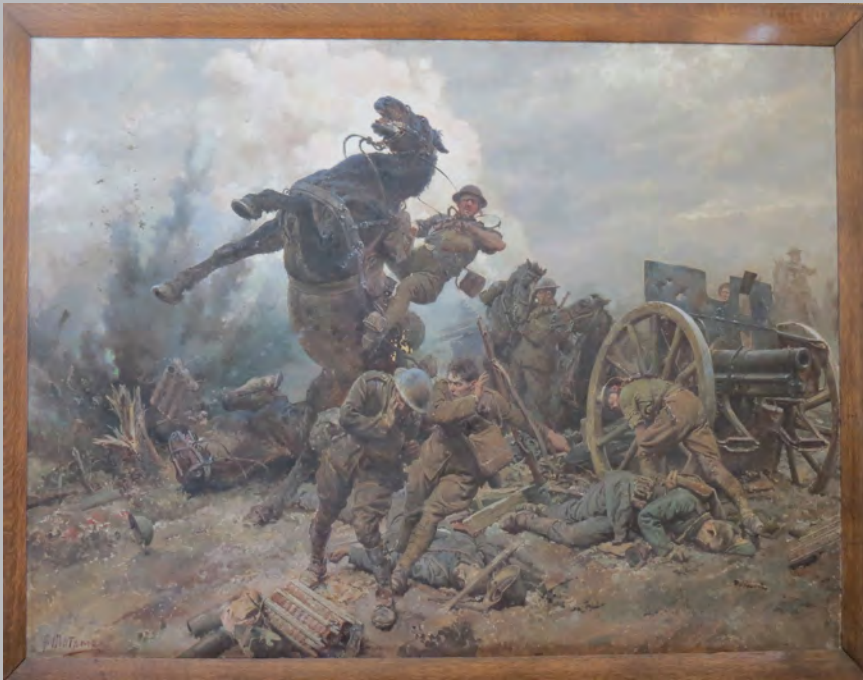
Artillery Painting, ca. 1914-1918, Fortunino Matania (1881-1963), Oil on Canvas, NU595.

I contact the gallery and after talking with them and Matania's biographer, I not only learned more about him, his life story, and his works. The fact that the study, and the painting for that matter, is astounding—Matania's studio was bombed during the London Blitz in World War II. After some very careful consideration, the museum decided to purchase the study and it arrived wrapped up, safe and sound—it was like Christmas morning for us all when we opened it up! We're hopeful to exhibit the study and the painting side by side sometime in the near future after the painting is conserved (see the insert for Adopt an Artifact) to highlight our Matania contemplated his work and modified it from the study to the canvas.